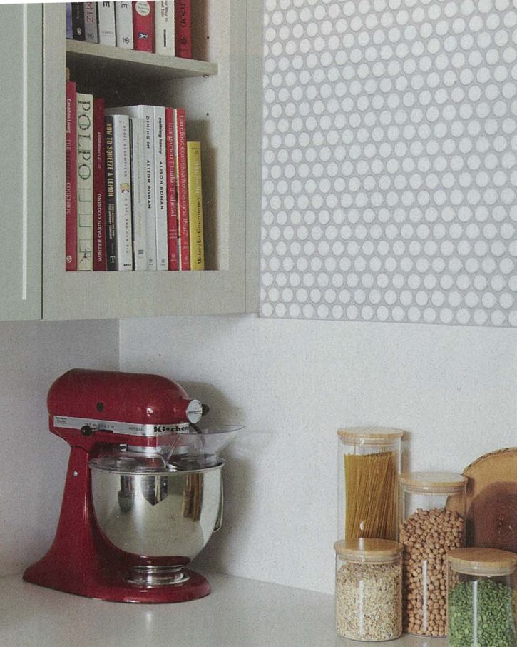
ABOVE: Tucked into the corner, compact open shelving is the perfect place for cookbooks. BELOW: A built-in niche displays vases, teapots and vessels. Sconce, F/los.